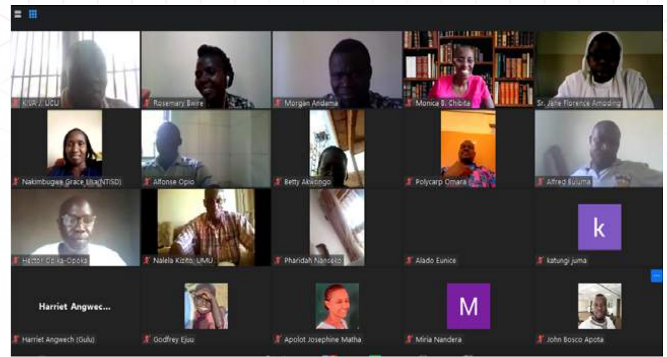
Participants attending a training via zoom.