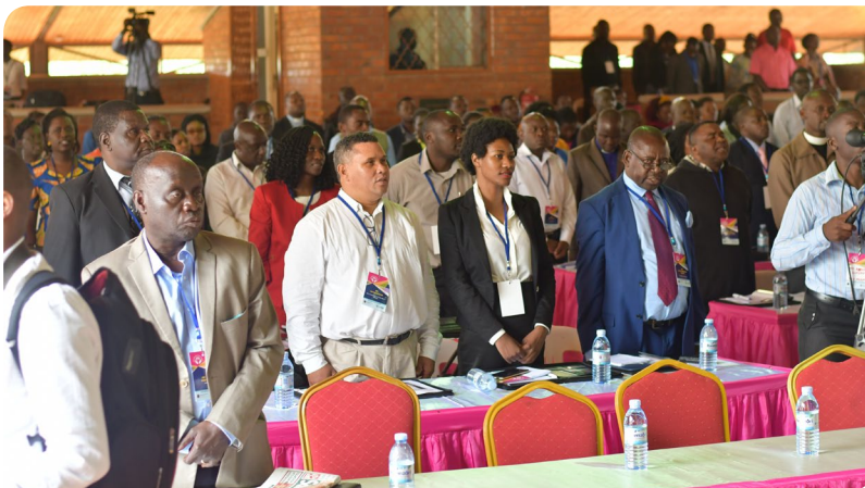
Some of the participants who turned up for the Conference on the family.