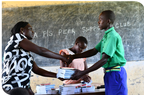
AfriChild rewards students of Atira Primary School with books for successfully steering menstrual hygiene management in school