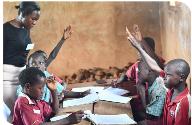
Children participate in data collection during a research undertaken by AfriChild