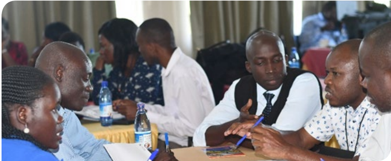
Above: Participants engage in a group discussion during a training session.

evidence to inform their work in relation to addressing violence against children with focus on CSAE. The research undertaken by AfriChild will inform and influence the development of child focused policies and practices in Uganda.