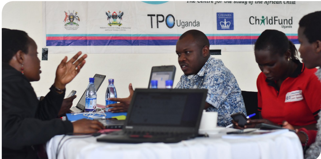
Above: Some of the civil society practitioners who attended the practitioners training organised by AfriChild at Fairway Hotel