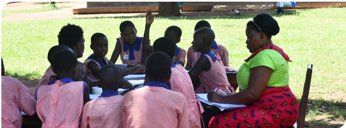
An ongoing Focus Group Discussion during the Mentorship Study.

AfriChild together with Columbia University and World Vision prepared and submitted a proposal to World Vision UK to the Research in Humanitarian Crises (R2HC). The proposal focused on a randomized control trial study on enhanced Child Friendly Spaces (CFS) interventions for children affected by conflict and displacement in northern Uganda. AfriChild is leading the qualitative research arm of the study while Columbia University heads the quantitative arm.