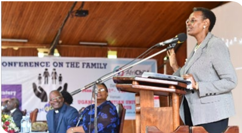
The First Lady, Hon. Janet Kataaha Museveni delivers her speech during the Conference on the family.

AfriChild used the conference to disseminate its research findings on ICT and VAC; social norms connected to VAC and risk and protective factors for VAC in residential care institutions.